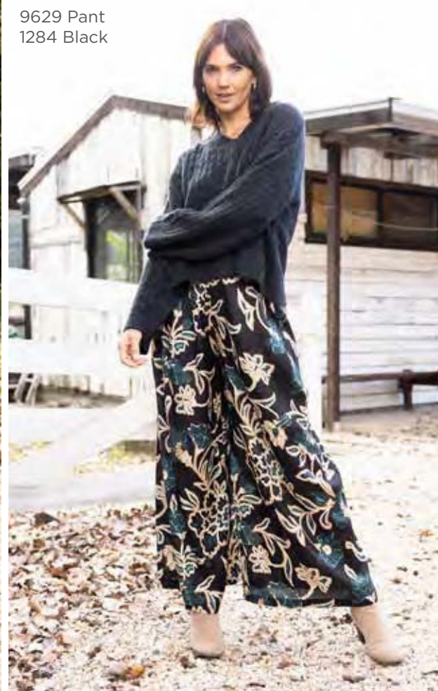
9629 Pant 1284 Black