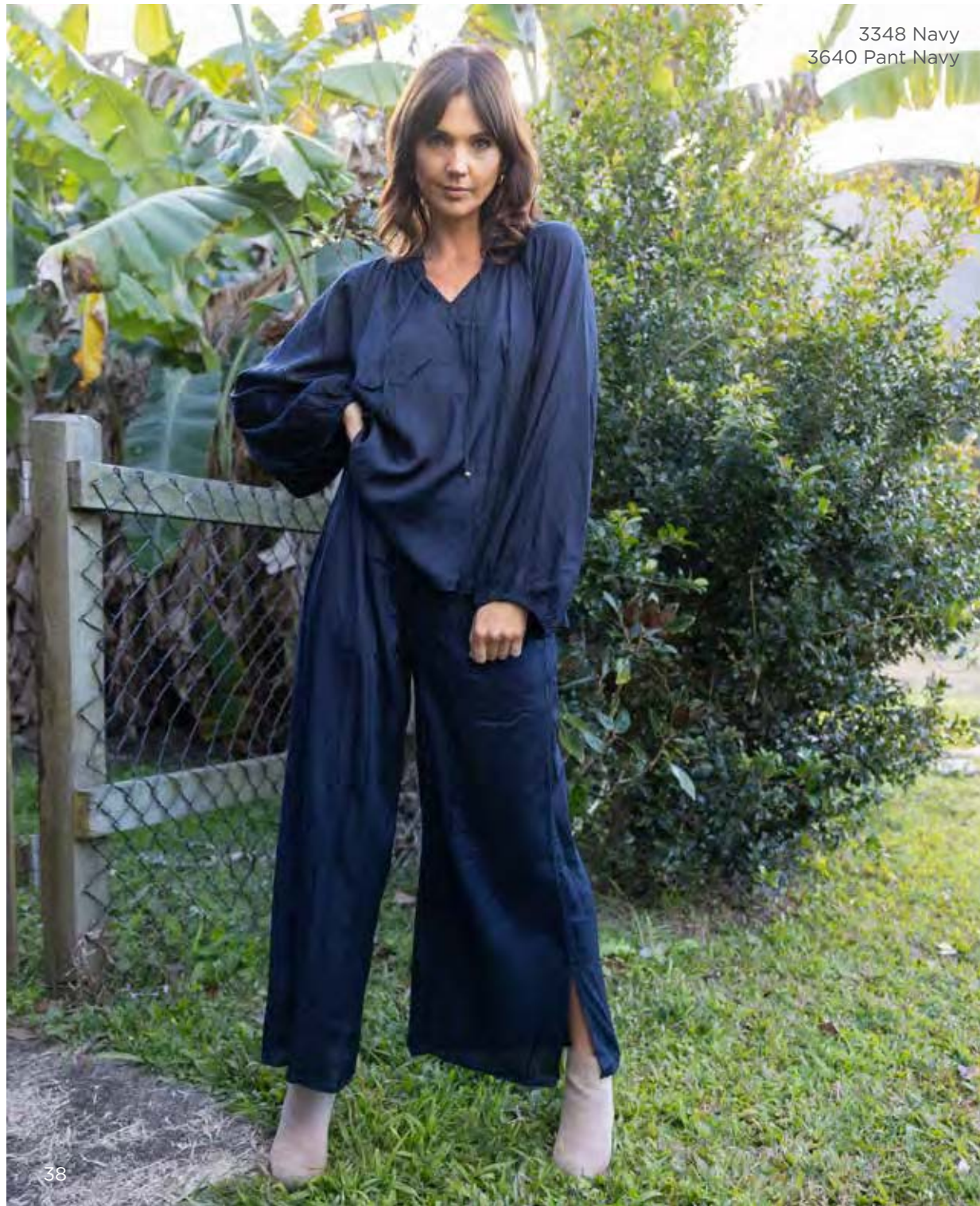
3348 Navy 3640 Pant Navy