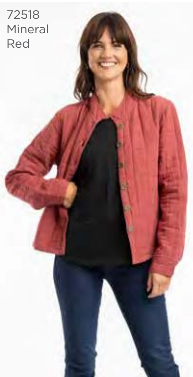
72518 Mineral Red