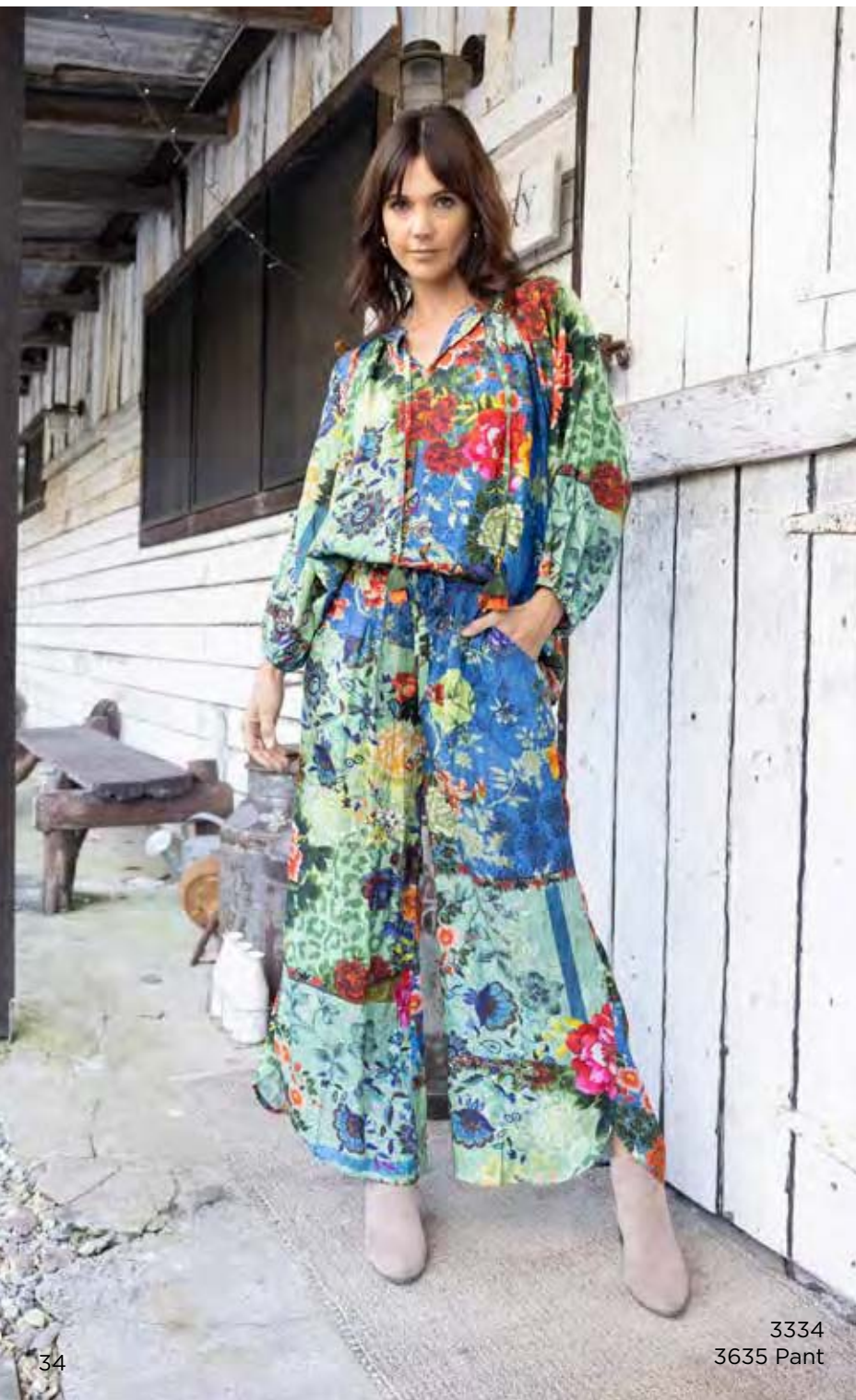
3334 3635 Pant