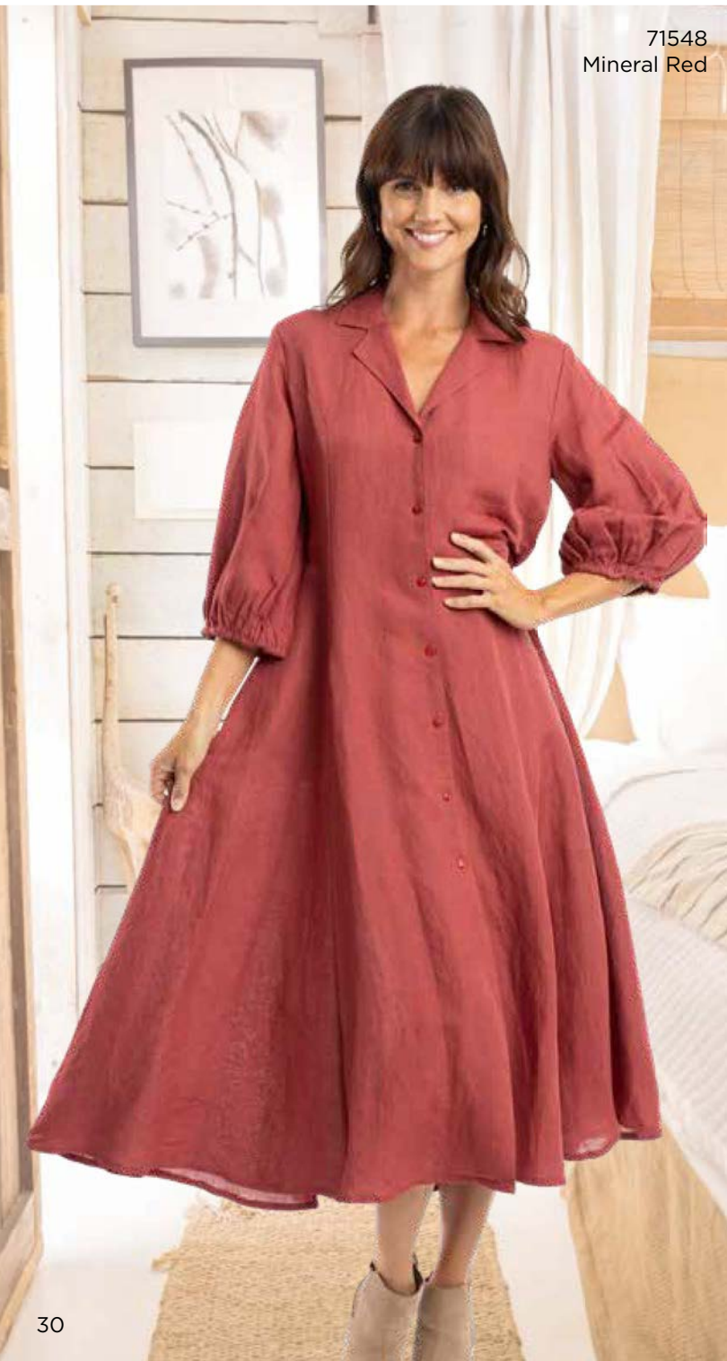
71548 Mineral Red