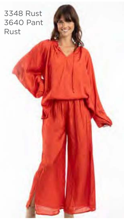
3348 Rust 3640 Pant Rust