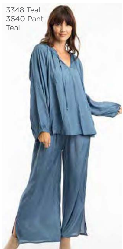
3348 Teal 3640 Pant Teal