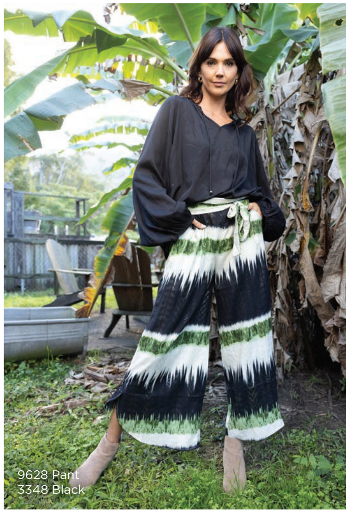
9628 Pant 3348 Black