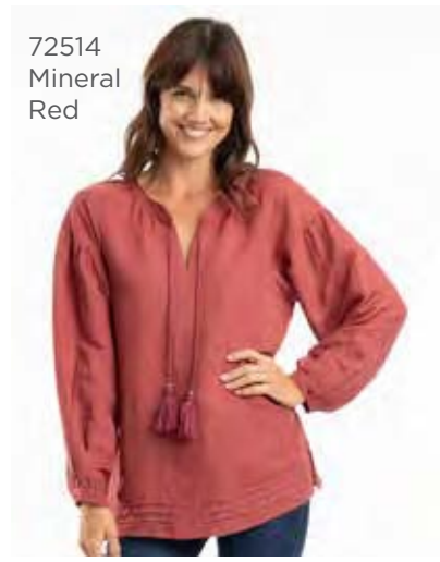
72514 Mineral Red