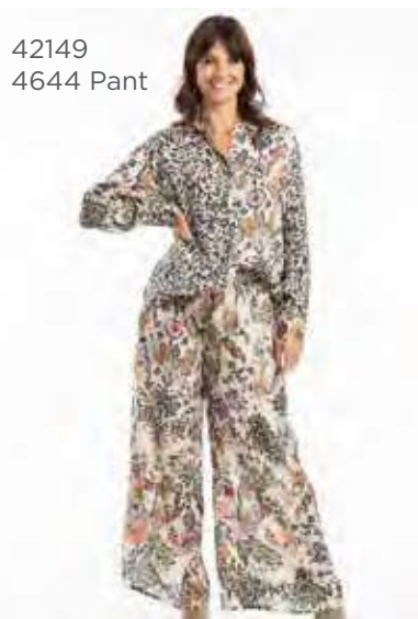
42149 4644 Pant