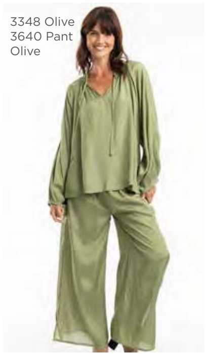
3348 Olive 3640 Pant Olive