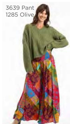
3639 Pant 1285 Olive