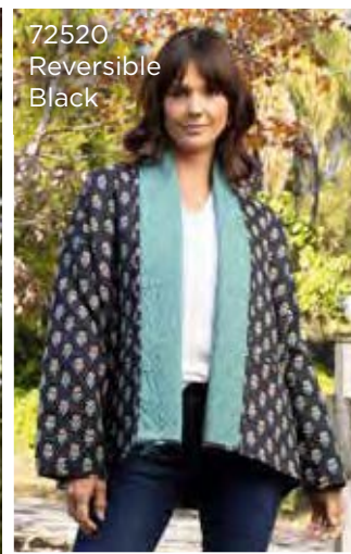
72520 Reversible Black