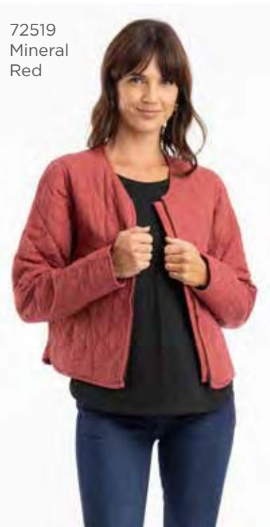
72519 Mineral Red