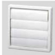
PER-100W Back draft shutter.