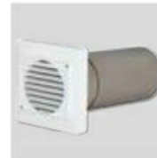
FIXED SHUTTER AND TELESCOPIC DUCT (200 to 420 mm).