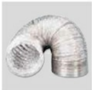
GSA-100 Flexible aluminium ducting.