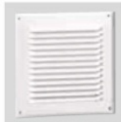
GRA-75 Aluminium exterior grille.