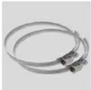
CX-80/125 Worm drive ducting clip.