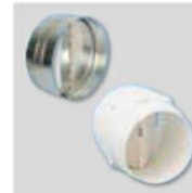
CAR-100 CM-130 Back draft shutters.