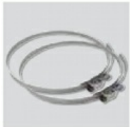
CX-80/125 Worm drive ducting clip.