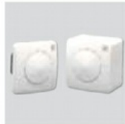
REB Single phase electronic speed controllers.