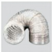
GSA-100 Flexible aluminium ducting.