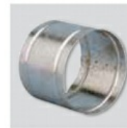
MRT-100 Circular duct joining piece.