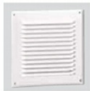
GRA-75 Aluminium external grille.