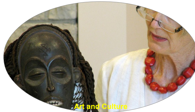
Art and Culture