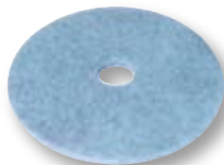
Blue Blend® UHS Burnishing Pad