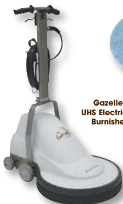
Gazelle® UHS Electric Burnisher