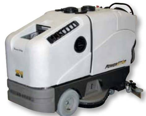
PowerStar® Z1 Propane Automatic Scrubber