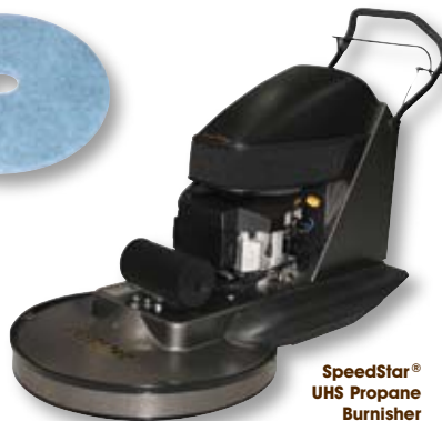
SpeedStar® UHS Propane Burnisher