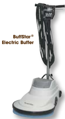
BuffStar® Electric Buffer