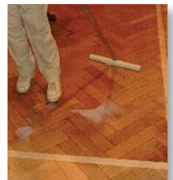
Easy to Apply