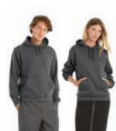
with B&C Hooded