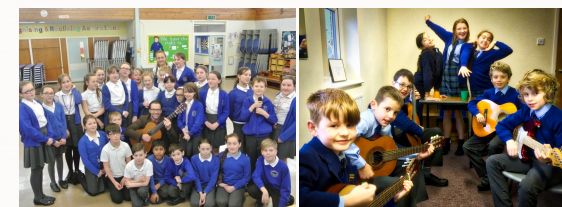
Working with schools, colleges and organisations.