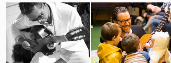
Background and bespoke performances for events.