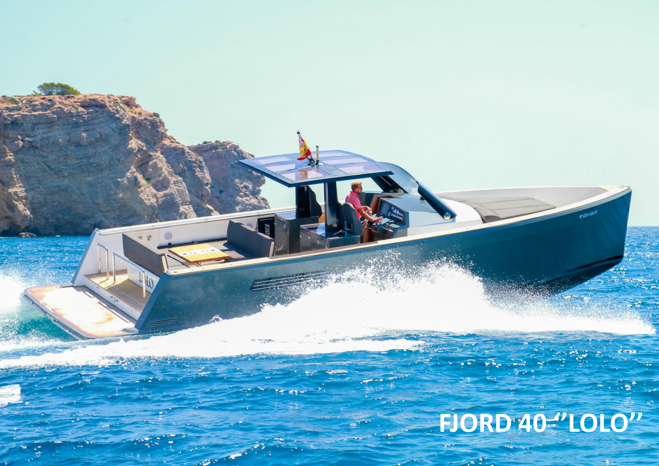
FJORD 40 "LOLO"