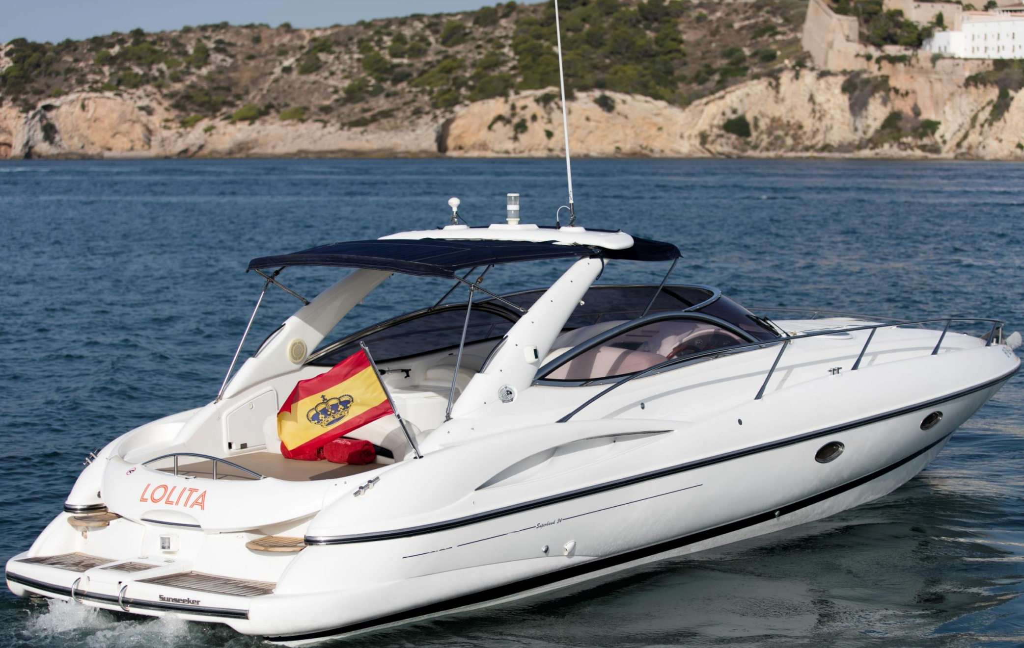
SUNSEEKER SUPERHAWK 34 "Lolita"