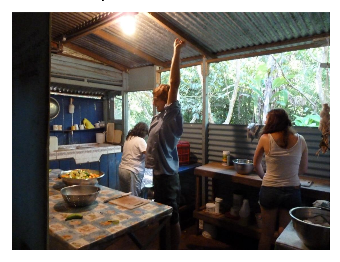
Early morning start!