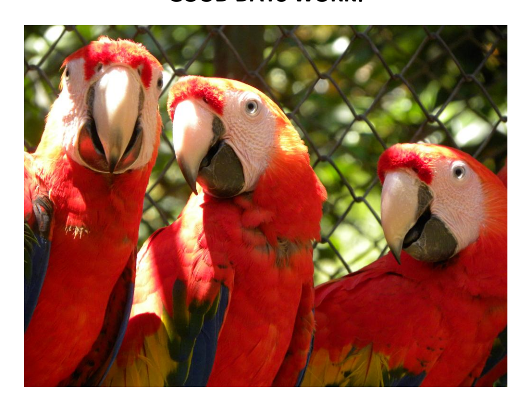
THANK YOU F.A.W.N!