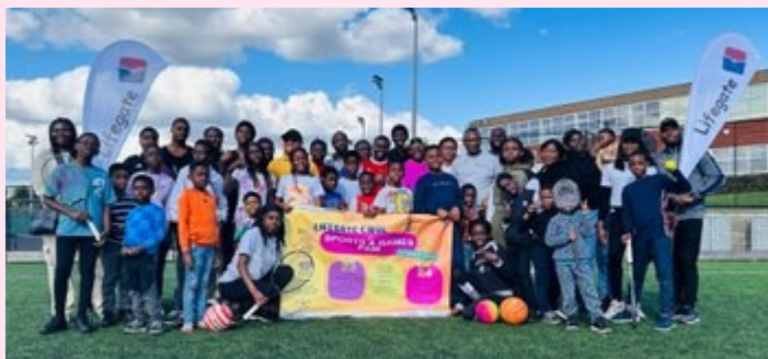
Commonwealth Games Legacy Sports Fair, August 2024.