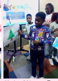
Life Literacy Initiatives (National Literacy Trust)