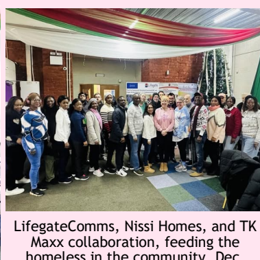
LifegateComms, Nissi Homes, and TK Maxx collaboration, feeding the homeless in the community. Dec. 2024.