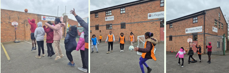
Adolescents during Easter activities

The Easter holiday activity, FITGEN-NEXT, a healthy lifestyle initiative for adolescents in Walsall community, and organised by Lifegate Communities, and supported by Public Health