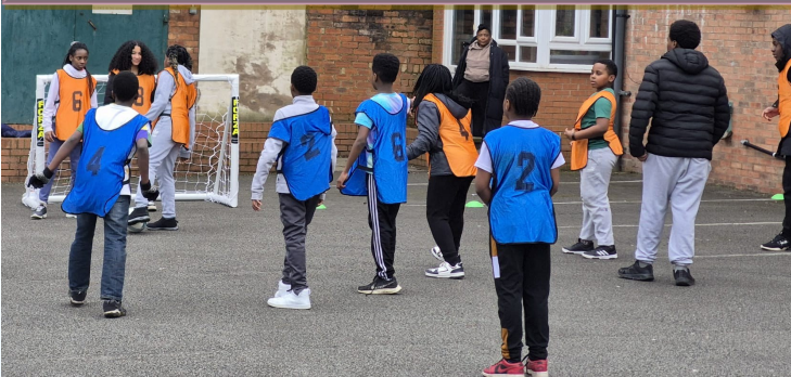
Adolescents keeping fit and having fun at the same time.

Adolescents were divided into four groups, working together to proffer solutions to problems of overweight. It was quite humbling to see adolescents putting teamwork into practice, working to achieve healthy living.