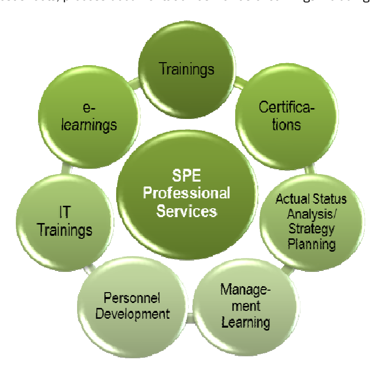
Our Professional Services at a Glance

We consider complex and difficult tasks as a challenge and develop, together with our customers, requirement-specific and optimal solutions. Whether it is a software implementation, software update or release change, we advise our clients and provide them with continuous support from the very beginning to ensure a high level of customer satisfaction. We not only develop solutions, but we also offer trainings for your employees using proven training techniques. For that, we develop tailor-made training materials such as training guides, test sheets, process documentation as well as e-learnings including final tests.