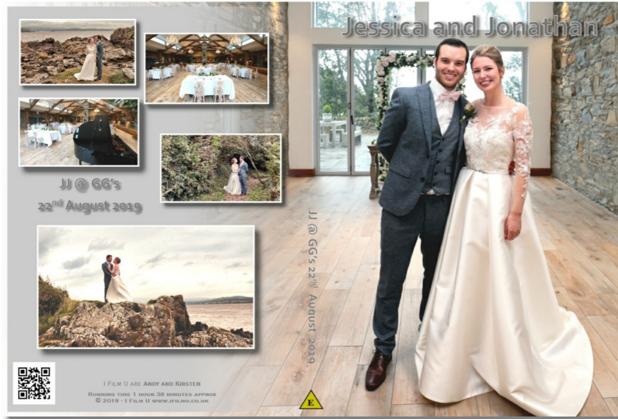
example standard disc cover