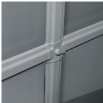
Georgian Bars (Internal)