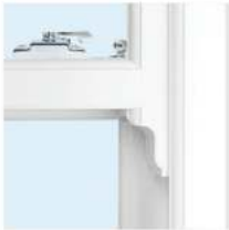
Run-Through Sash Horn