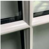
Astragal Bars (External)