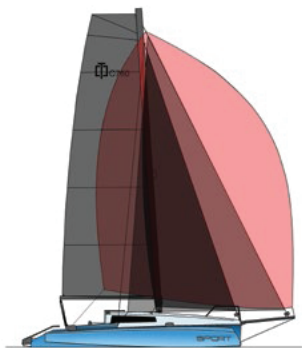
CORSAIR 760 Sport

“ The trailerability and versatility of your Corsair allows you to explore remote cruising grounds far from home. Start planning your next sailing adventure holiday now! ”