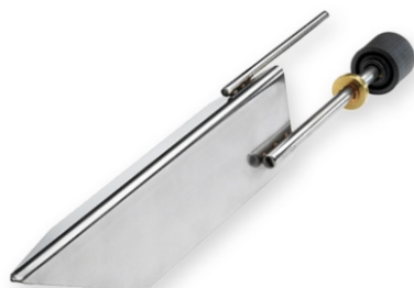
Electrode Sets: Electrodes ONLY

"O" Ring Set Hand Nut Sets sold separately