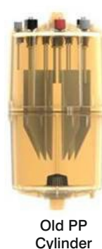
Old PP Cylinder