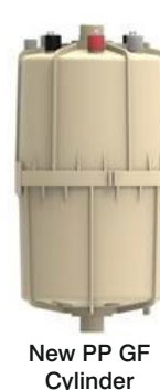
New PP GF Cylinder