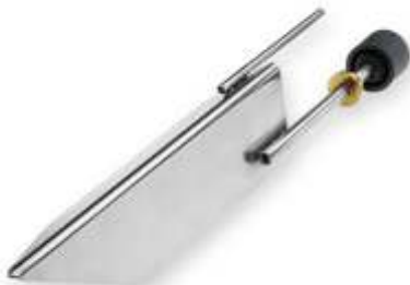
Electrode Sets: Electrodes ONLY

"O" Ring Set & Hand Nuts sold separately