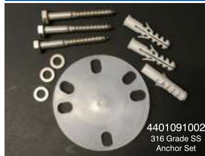
4401091002 316 Grade SS Anchor Set