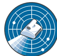
CleverClean™ scanning system