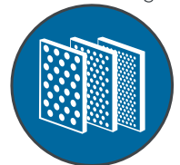
3 filtration options