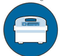
Full filter and operation delay indicators