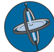
Gyro pro scanning system