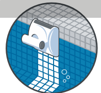
Walls & water line cleaning