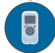
Remote control unit