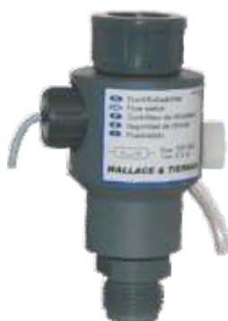
5 AAA7000 Flow Switch