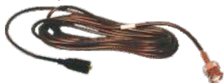
U93838 - Sensor Lead for pH & Redox Probes