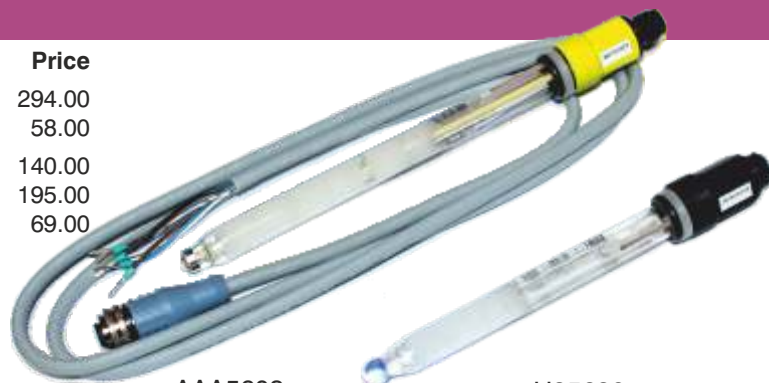
AAA5608 Chlorine Sensor c/w Cable