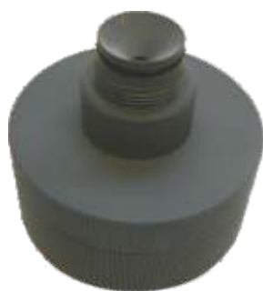
6 AAA6991 Flow Regulator