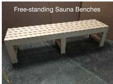
Free-standing Sauna Benches