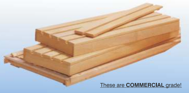
These are COMMERCIAL grade!