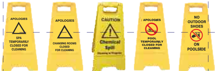
CL37 CL38 CL41 CL42 CL43

Check out below our custom sign service, where we can produce almost any message on the floor signs to suit your specific requirements.