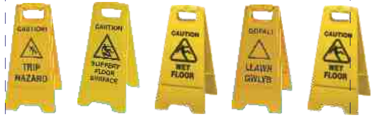
CL23 CL24 CL25 Side 1 CL26 Side 2