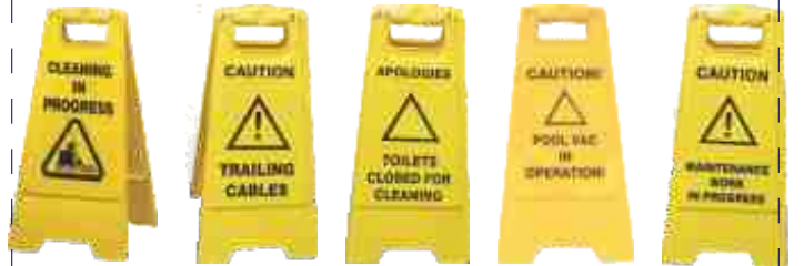
CL27 CL28 CL35 CL36 CL39