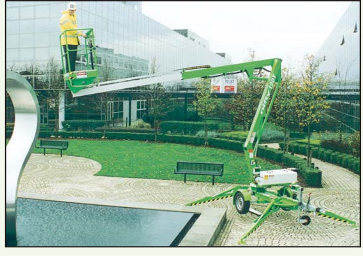
The telescopic boom provides outstanding working outreach especially at lower levels where it's needed most.

Due to a policy of continuing development and improvement, Niftylift reserves the right to change any specification without notice. Please confirm exact specification before ordering.