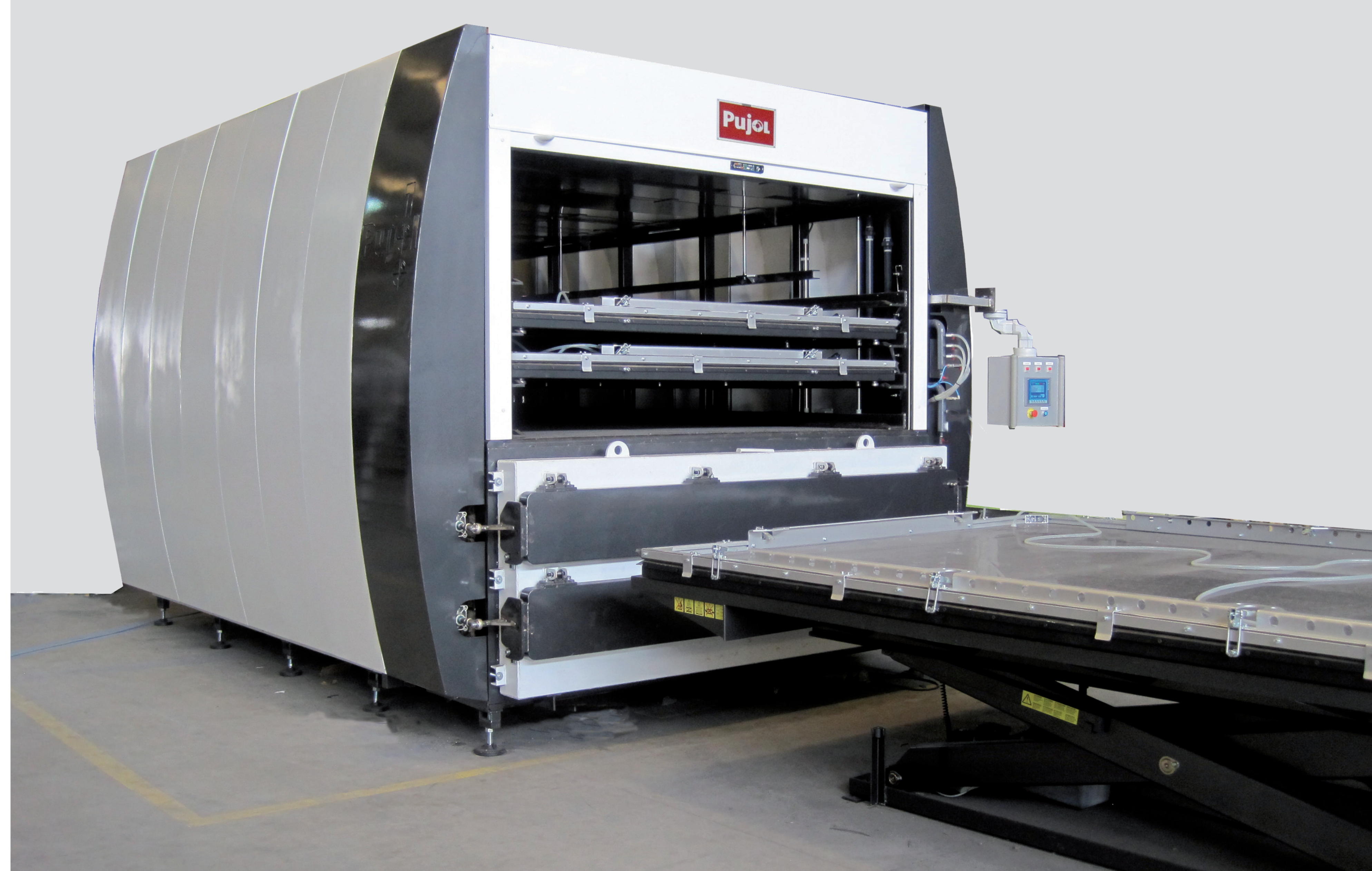
Pujol 100 PVB