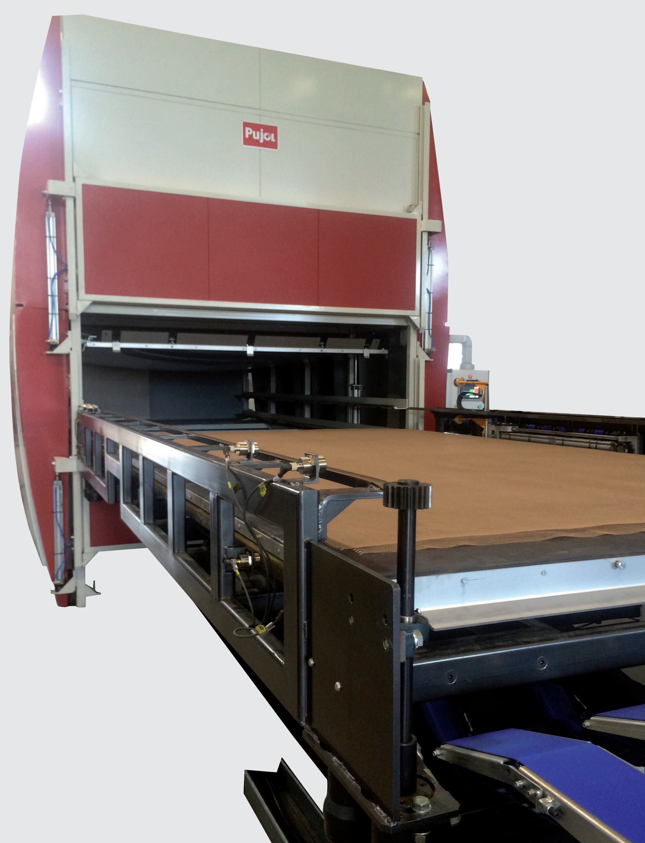
Pujol 100 Fast Curing