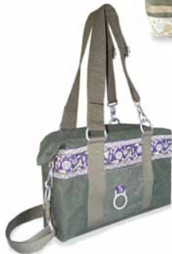
575.035 MARIANDL S DELUXE