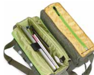
INNER COMPARTMENT KAMERAD

There are small, large, fat and tall companions equipped with a functional padded inner compartment. Every item gets its place and that makes it easy for the user to organize the bag. The companions' girlfriends are named Heidi, Rosi, Liesl, Klara, Annerl, Toni, Poldi, Sissi ... these models are more playfully decorated with braids, cheerful fabrics and colorful inside pockets.