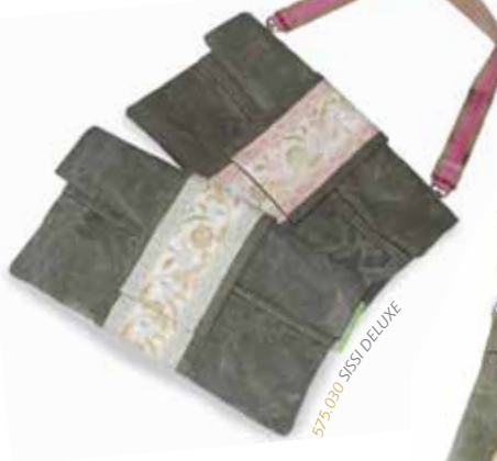
575.030 SSSI DELUXE