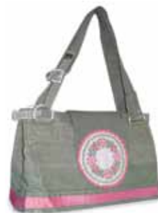
571.027 ROSI'S BRAID