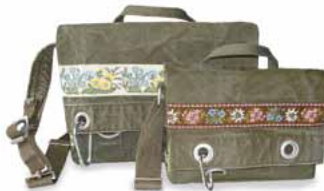
570.021/22 KAMERAD MINI/SMALL WITH BRAID