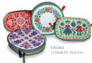
570.003 COSMETIC POUCH