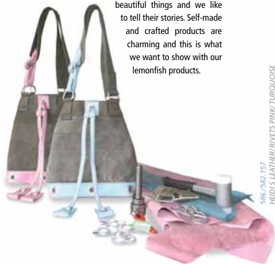
586/582 157 HEIDI'S LEATHER/RIVETS PINK/TURQUOISE

a repeated discovery. We love beautiful things and we like to tell their stories. Self-made and crafted products are charming and this is what we want to show with our lemonfish products.