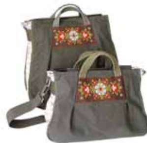
571.033/34 ANNERL S/M

Traditional weaving is a craftsmanship dying out in Germany. The lovely braids we are using are rediscovered old stocks, many of them are not being produced any more as the necessary looms are no longer available and there are no people able to work with such looms. The braids are often made of cotton, decorated with alpine motifs, formerly used for high-quality table or bed linens. We have various quantities of many different motifs in our warehouse and are using them as long as stocks last. By using the braids and by putting them into a new context, they are getting the attention they deserve – and this gives us a fortunate feeling.