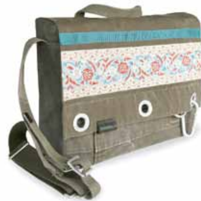
575.023 KAMERAD LARGE DELUXE

» WE ARE PRODUCING FAVORITES, Wir produzieren Lieblingsstücke, HANDMADE IN GERMANY!« handgefertigt in Deutschland!«