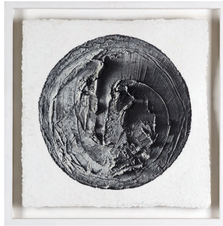
Himmelskörper 164 2022, 60 x 60 cm, black oxide, marble dust on handmade paper © Aloys Rump 2022