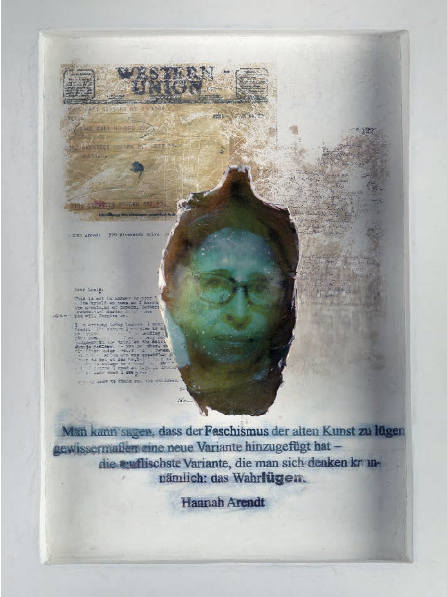
Hannah Arendt 2018, box with brain shell and text, 67 x 51 x 5 cm © Aloys Rump 2018

"Vogelschau. Imaginäre Perspektiven im bildnerischen Werk von Aloys Rump" in: "Vom Zittern der Zeit", p. 14, exhibition catalogue Museum Boppard, 01.12.2019–26.01.2020