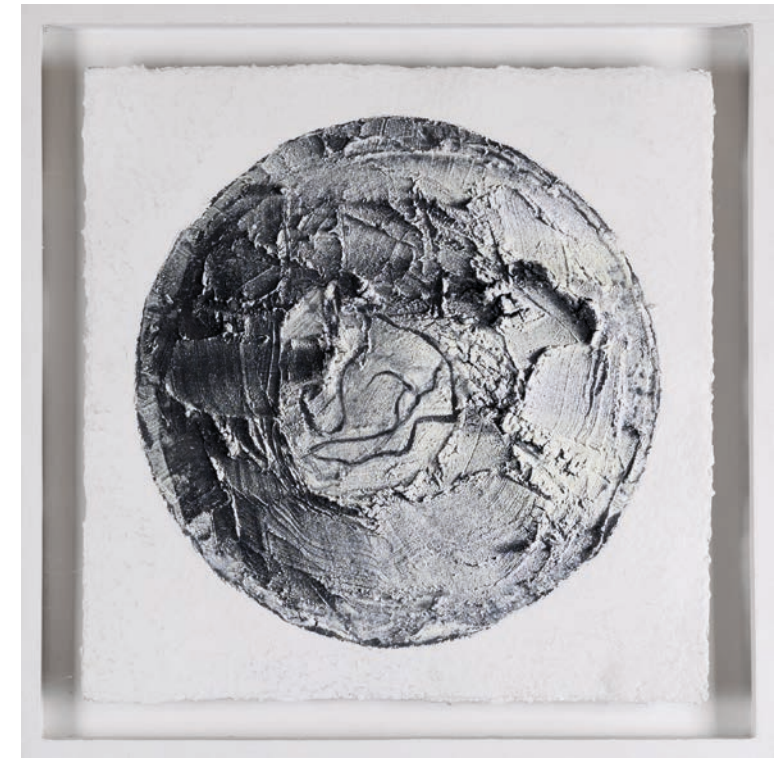
Himmelskörper 211 2023, 60 x 60 cm, black oxide, marble dust on handmade paper © Aloys Rump 2023