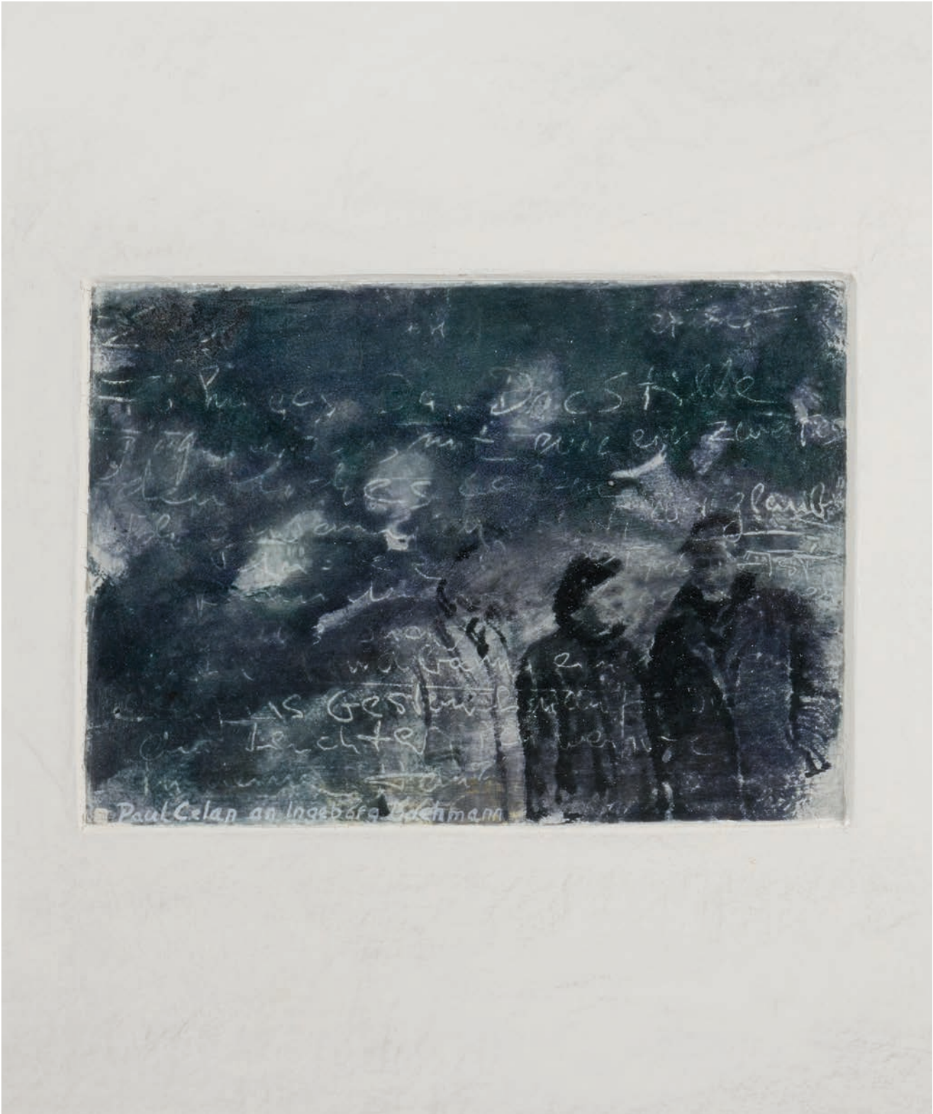
Paul Celan in Igenborg Bachmann 2017, mixed media on wood, 50 x 59 cm © Aloys Rump 2017 (Photo: Isa Steinhäuser)

Aloys Rump aloyrump@online.de www.aloyrump.de