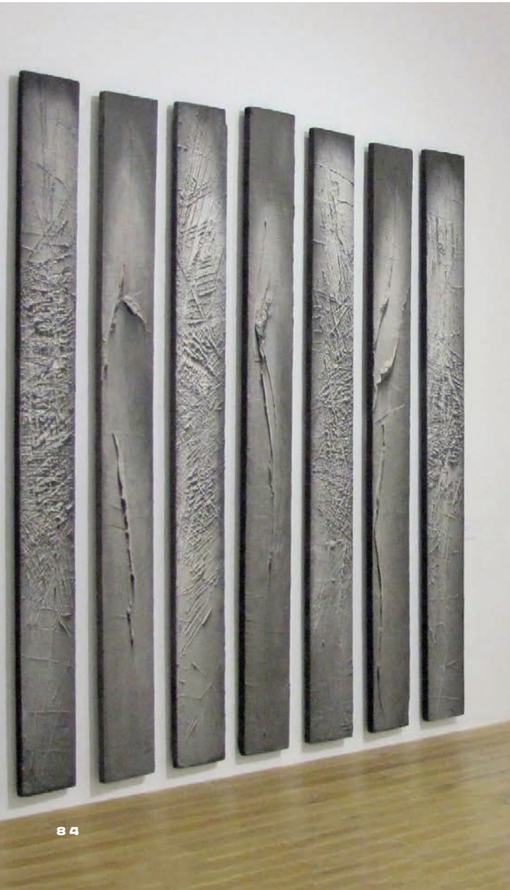
Der Staub der Türme Retrospektive 2014 „Die Ewigkeit hält sich in Grenzen“ Mittelrhein-Museum, Koblenz, © Aloys Rump 2014

In Rump's works, one encounters a rare fusion of formal abstraction and literary depth. A hallmark of his craft is the delicate integration of poem titles by the unforgettable German-speaking poet Paul Celan. It's as if each painting conducts a silent dialogue between brushstroke and verse.