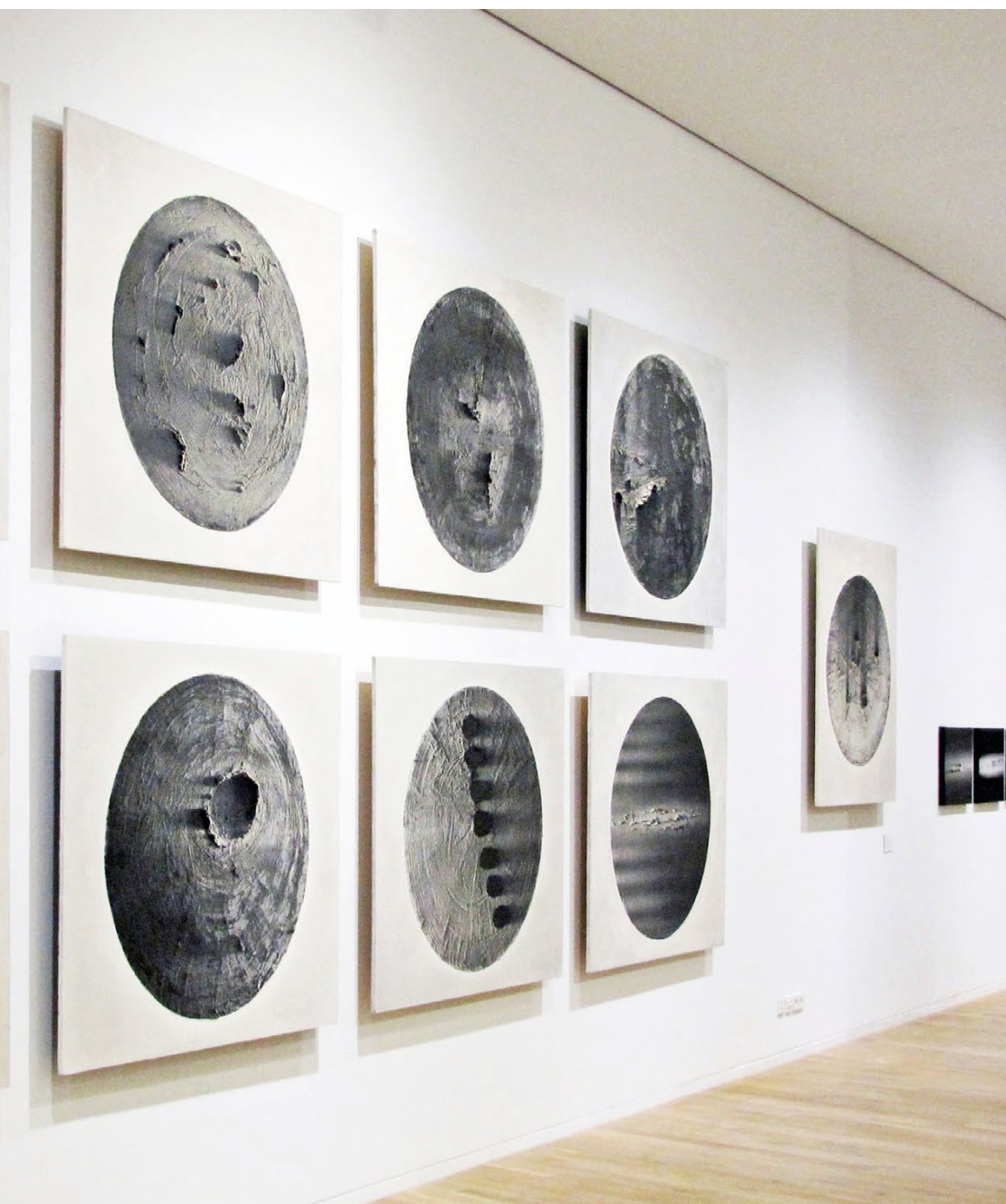
Retrospektive 2014 „Die Ewigkeit hält sich in Grenzen“ Mittelrhein-Museum, Koblenz, © Wolfgang Schneider 2014