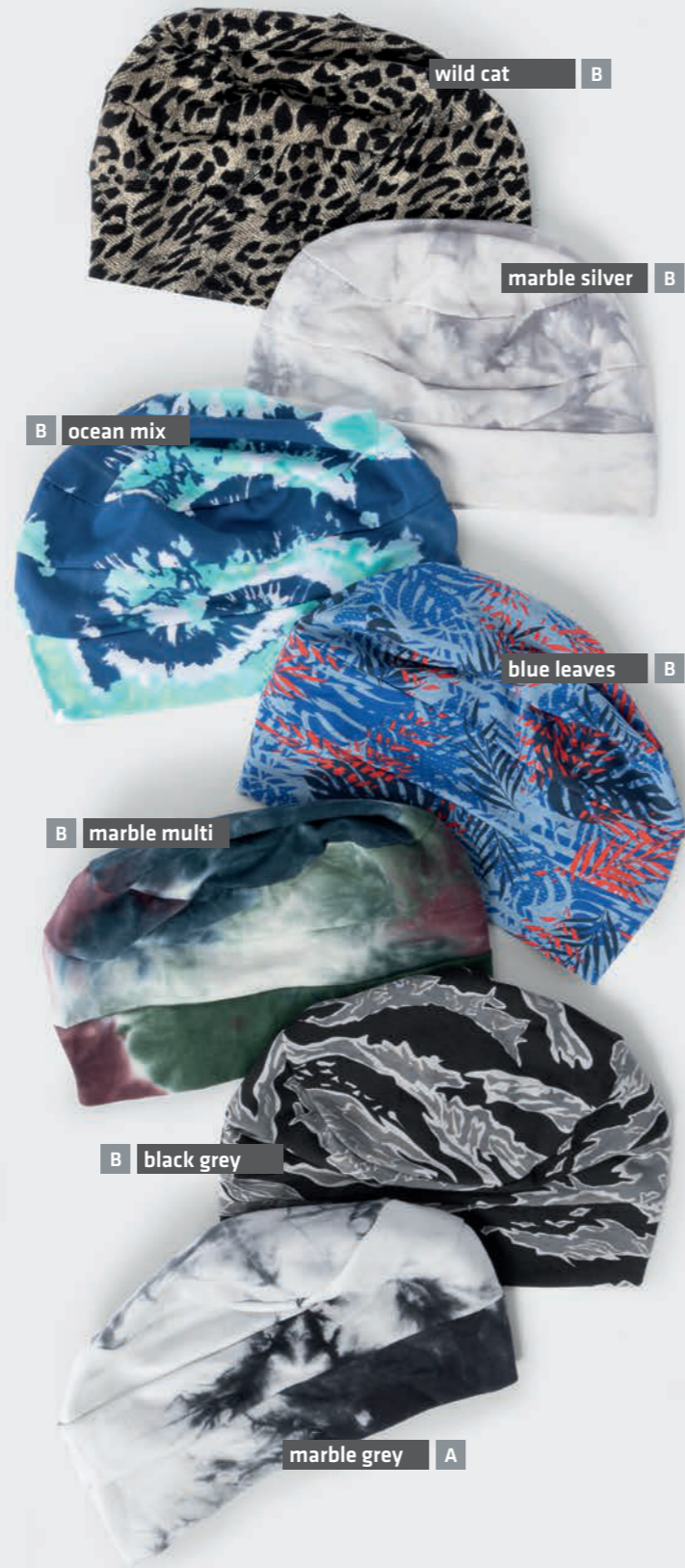
wild cat B