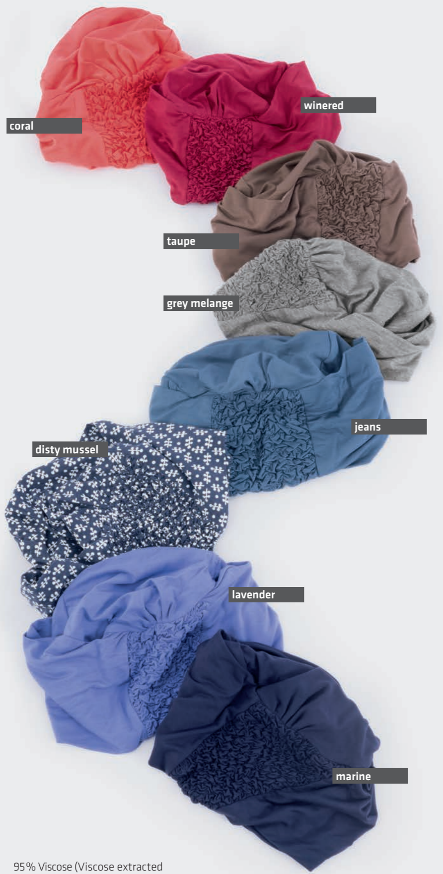
95% Viscose (Viscose extracted from Bamboo), 5% Elastane