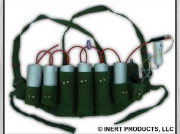
INERT SUICIDE VEST TYPE #2