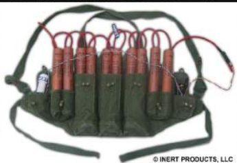
INERT SUICIDE VEST TYPE #3