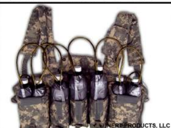
SUICIDE VEST TYPE #5