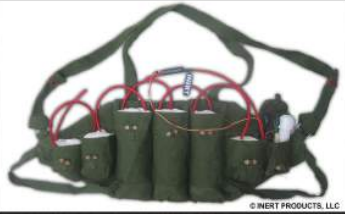
INERT SUICIDE VEST TYPE #1