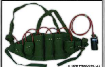
INERT SUICIDE VEST TYPE #4