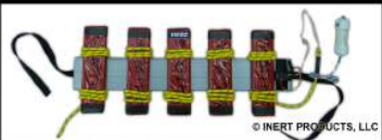
Inert Replica Red Semtex Block Suicide Belt – Type 2 Item# : OTA-1507