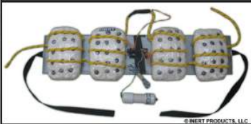
Inert Replica Suicide Belt – Type 1 Item# : OTA-1506