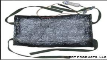
Inert Replica Suicide Vest / Belt / Satchel Item# : OTA-1513