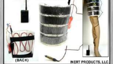
Inert Replica Suicide Device (Leg) Item# : OTA-1LEG