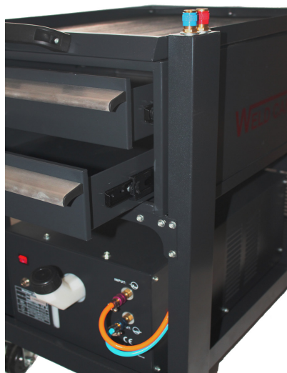
WELDCART Water cooling kit Part No. CAP0215