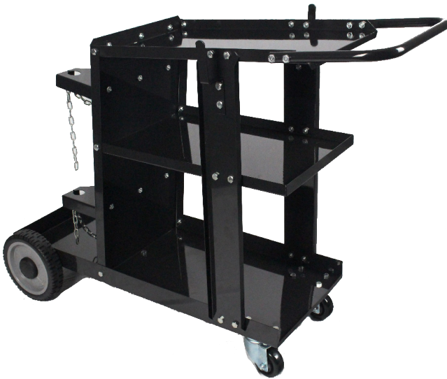
Inverter Trolley Part No. CAP0216