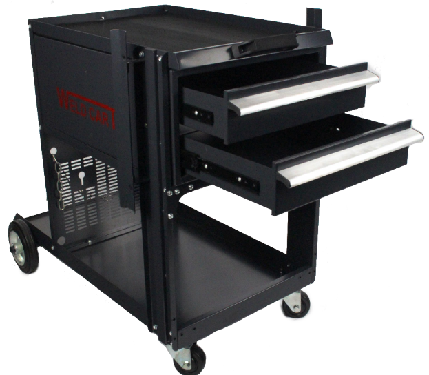
WELDCART Trolley Part No. CAP0214