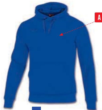
100887.700 / 101673.700 ROYAL