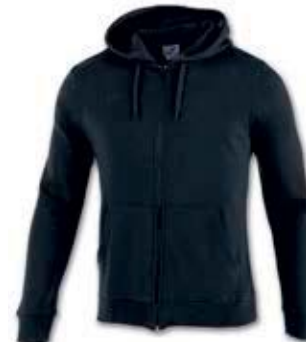
100888.100 / 101674.100 BLACK