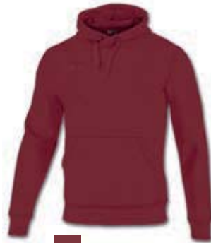
100887.671 / 101673.671 BURGUNDY