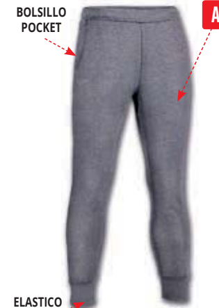
100891.280 / 101677.280 LIGHT MELANGE