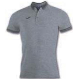
100748.250 LIGHT MELANGE