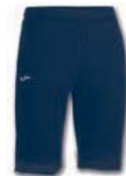
100892.331 / 101678.331 DARK NAVY