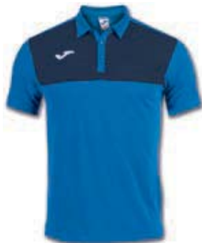
101108.703 / 101684.703 ROYAL/DARK NAVY