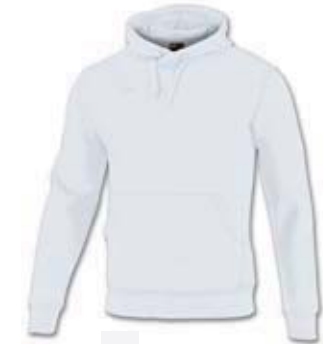
100887.200 / 101673.200 WHITE