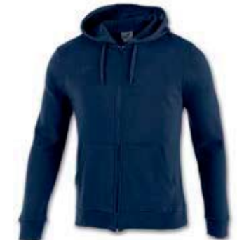
100888.331 / 101674.331 DARK NAVY