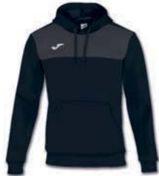
101106.110 / 101685.110 BLACK/ANTHRACITE