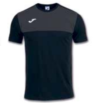
101107.110 / 101683.110 BLACK/ANTHRACITE