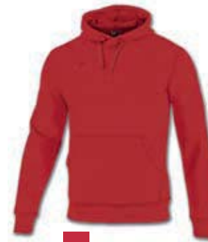
100887.600 / 101673.600 RED