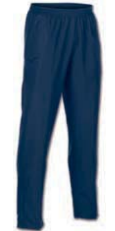
100890.331 / 101676.331 DARK NAVY