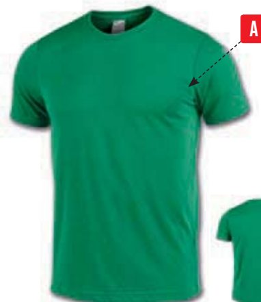
100913.450 / 101681.450 GREEN MEDIUM