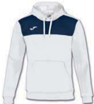
101106.203 / 101685.203 WHITE/DARK NAVY