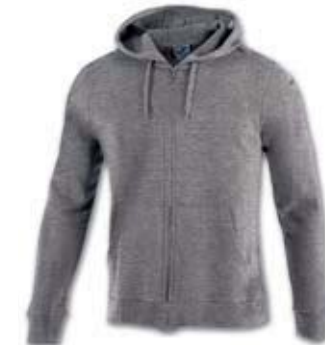
100888.280 / 101674.280 LIGHT MELANGE