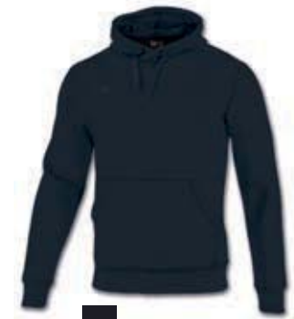
100887.100 / 101673.100 BLACK