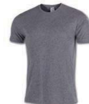
100913.280 / 101681.280 MELANGE MEDIUM