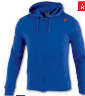
100888.700 / 101674.700 ROYAL