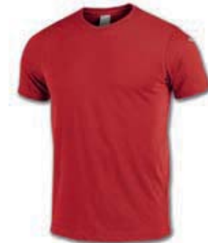
100913.600 / 101681.600 RED