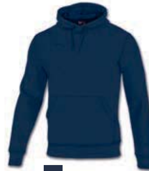
100887.331 / 101673.331 DARK NAVY