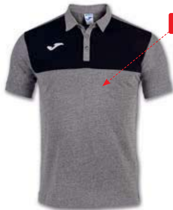
101108.281 / 101684.281 MELANGE MEDIUM/BLACK