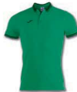
100748.450 GREEN MEDIUM