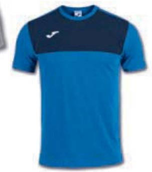
101107.703 / 101683.703 ROYAL/DARK NAVY