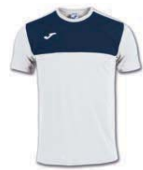
101107.203 / 101683.203 WHITE/DARK NAVY