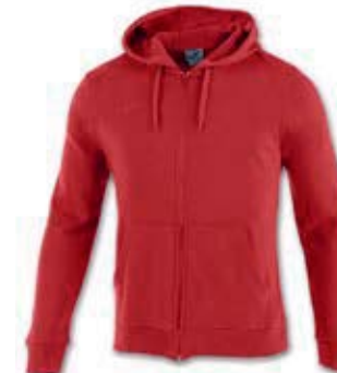
100888.600 / 101674.600 RED