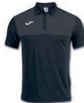
101108.110 / 101684.110 BLACK/ANTHRACITE