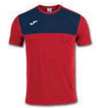
101107.603 / 101683.603 RED/DARK NAVY