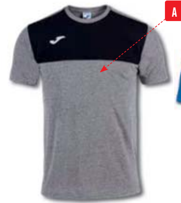
101107.281 / 101683.281 MELANGE MEDIUM/BLACK