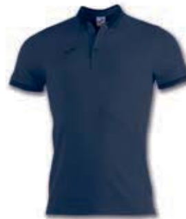
100748.331 DARK NAVY