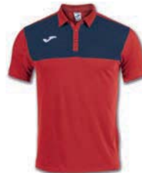
101108.603 / 101684.603 RED/DARK NAVY