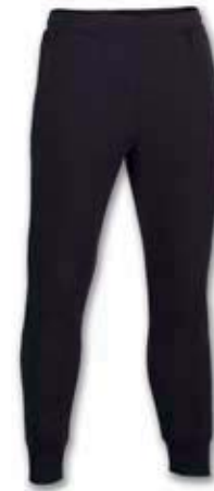
100889.100 / 101675.100 BLACK