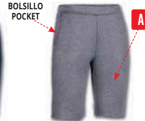
100892.280 / 101678.280 LIGHT MELANGE