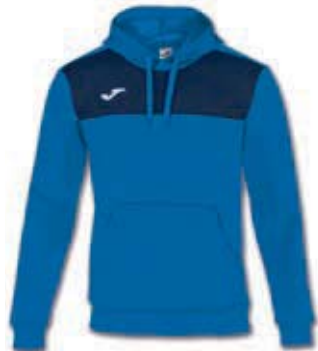
101106.703 / 101685.703 ROYAL/DARK NAVY