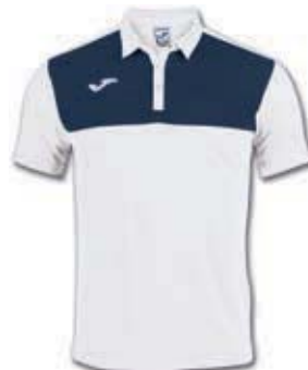
101108.203 / 101684.203 WHITE/DARK NAVY