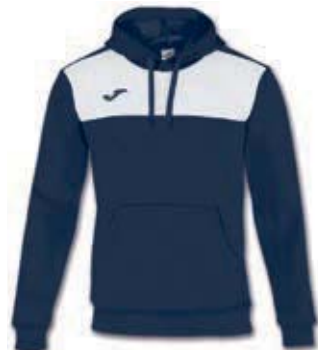
101106.332 / 101685.332 DARK NAVY/WHITE