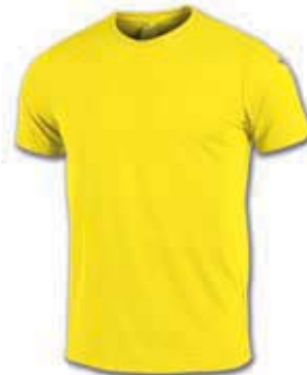
100913.900 / 101681.900 YELLOW