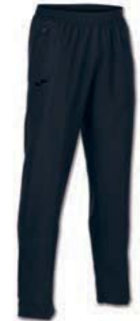
100890.100 / 101676.100 BLACK