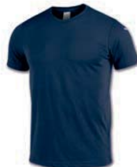
100913.331 / 101681.331 DARK NAVY