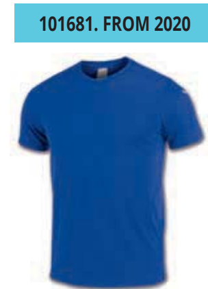
100913.700 / 101681.700 ROYAL