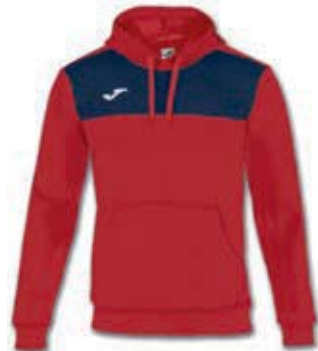
101106.603 / 101685.603 RED/DARK NAVY