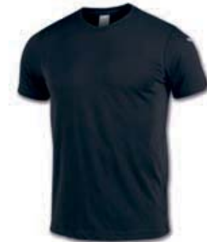
100913.100 / 101681.100 BLACK