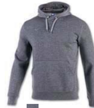
100887.280 / 101673.280 LIGHT MELANGE