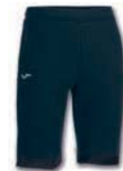
100892.100 / 101678.100 BLACK