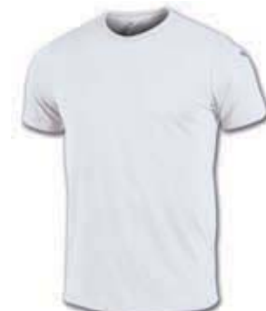
100913.200 / 101681.200 WHITE