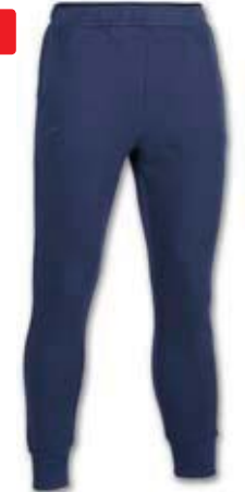
100889.331 / 101675.331 DARK NAVY