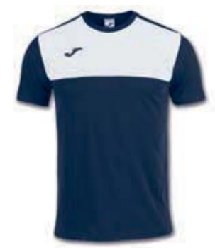
101107.332 / 101683.332 DARK NAVY/WHITE