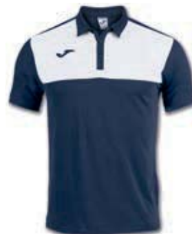
101108.332 / 101684.332 DARK NAVY/WHITE