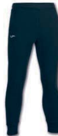
100891.100 / 101677.100 BLACK