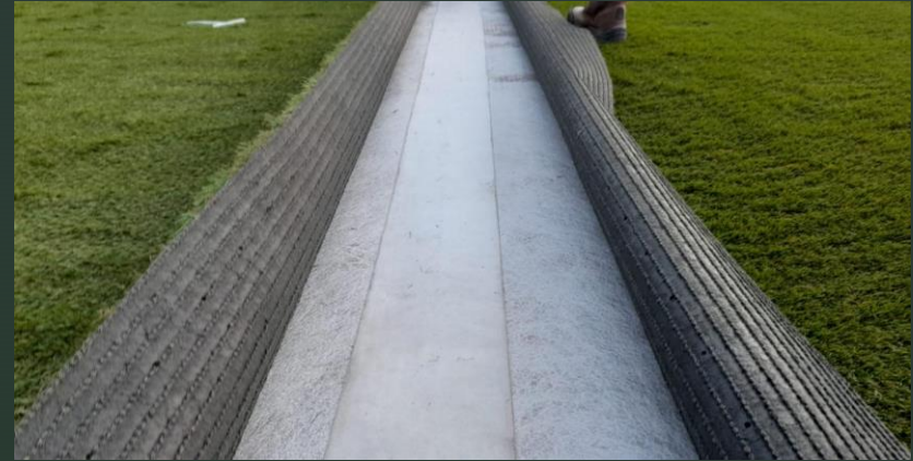
Peel back the artificial grass ready for joining tape