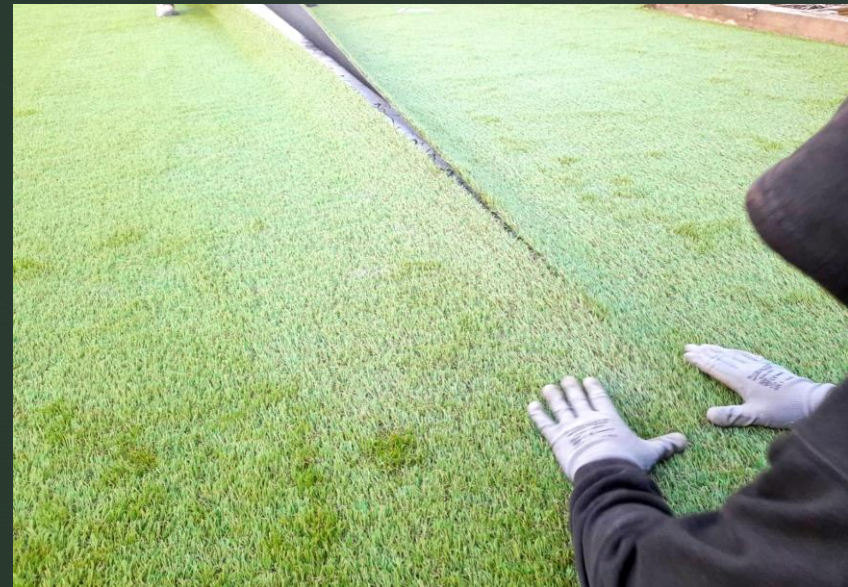
Carefully knit the two grasses together