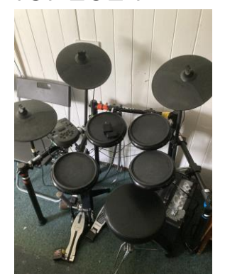
Alesis electronic drum kit £95

for used instruments & equipment for 2024