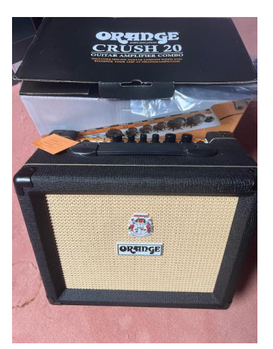
Orange Crush Amp as new £85