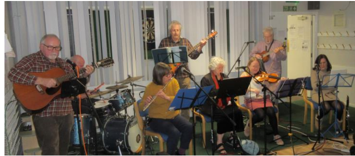
St Barnabas Band