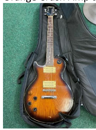
Left Handed Tanglewood electric £75