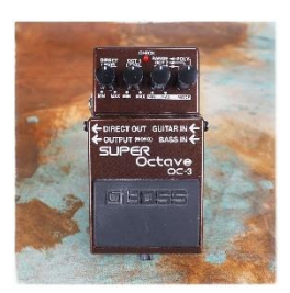
Boss DC3 Super Octave (£115 as new offers accepted)

****Special sale from one member Prices quoted cost as new but open to offers some maybe around HALF PRICE