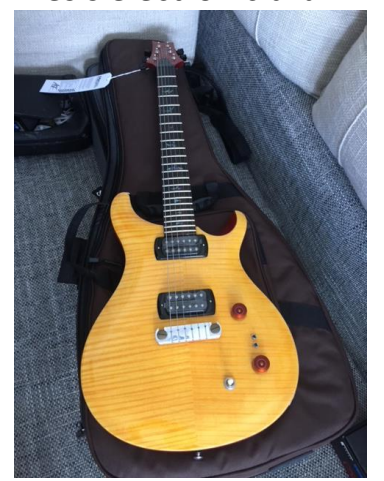
PRS guitar £650 as new