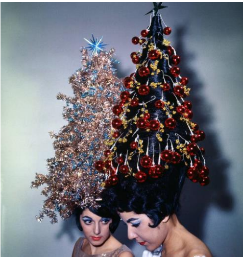
Ideal apparel for the club Christmas lunch.