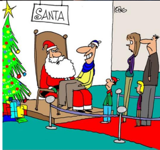
"Yes, I know! You want a classic MG for Christmas. Now get off me as I can't feel my legs!"