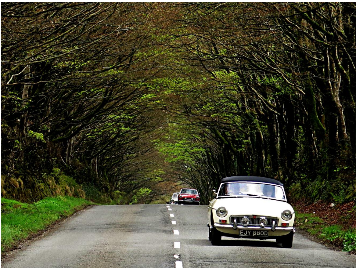
Keith & Sally failed to run Howard over as he stood in the middle of the road to take this picture of our cars passing through an avenue of arching trees, just coming into bud.

The run started at 11am. Leaving the car park and turning right to head towards Tavistock, the roads were relatively quiet and everyone got under way ok, some with their tops down, braving the chilly but dry weather.