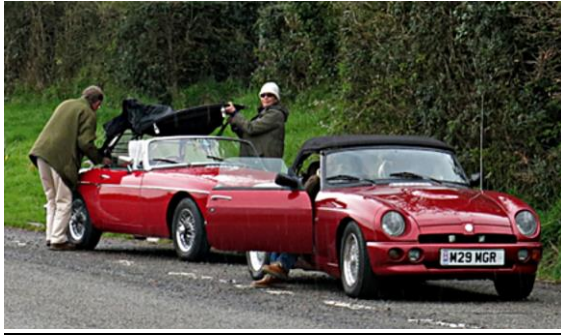
Hoods up just before the deluge

The drive took us down country lanes, some narrow and muddy, through the villages of Chillaton, Portgate, Tinhay, Luckett, Callington, St Mellion and eventually finishing at Pillaton. The route took us across the Tamar over the Horsebridge which we now know was constructed in 1437.