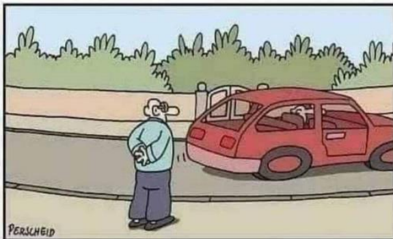
(This is a joke that doesn't work if it has to be explained)