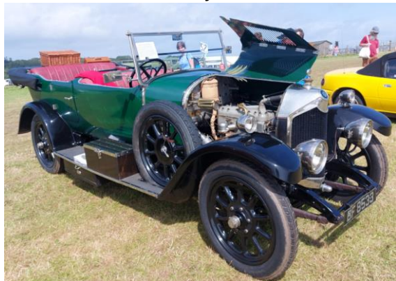
A rare 1924 Crossley Tourer said to have been used by the Duke & Dutchess of York on their tour of New Zealand in 1927