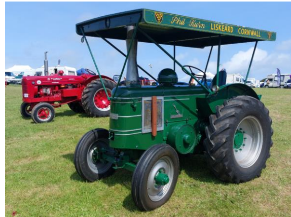
From Liskeard a Field Marshall steamer & a McCormick International tractor