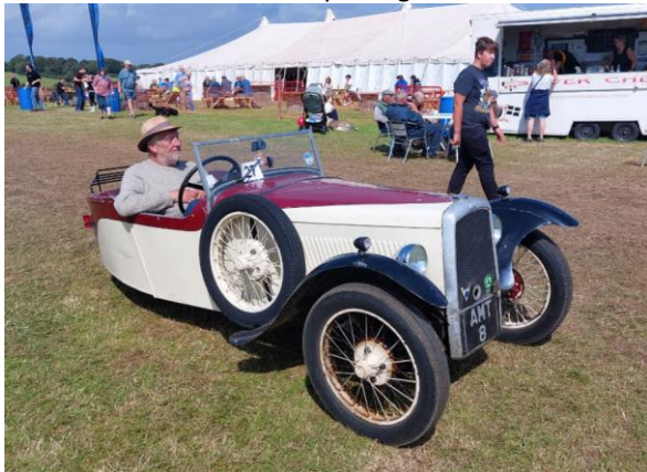
BSA trike c.1932