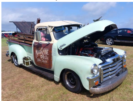
GMC Hydramatic c.1965