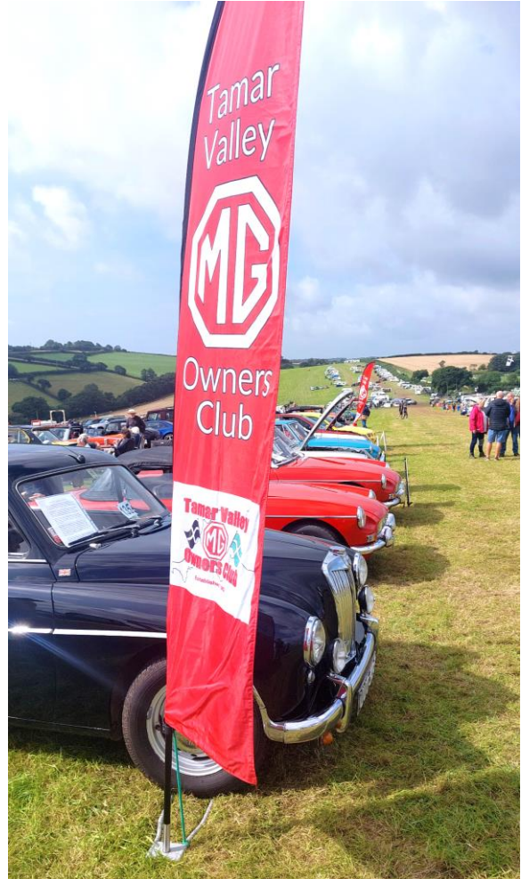
TVMGOC flying the flags at Great Trethew