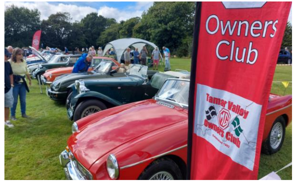
Boys and their Toys (see also this month's caption comp photo)