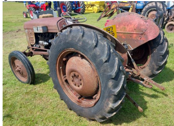
Just needs a bit of T-cut and a polish