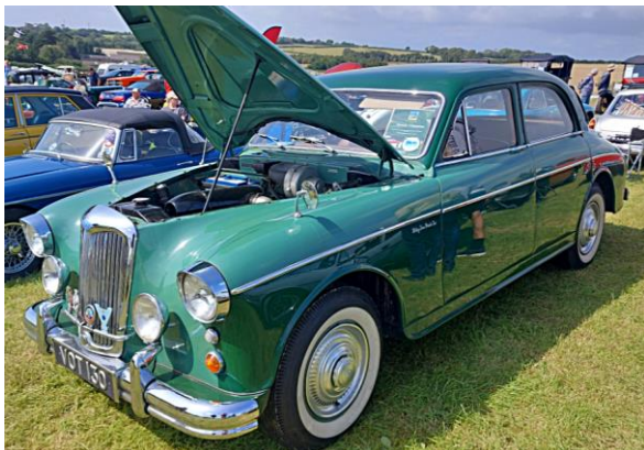
Riley 2.6 c.1958