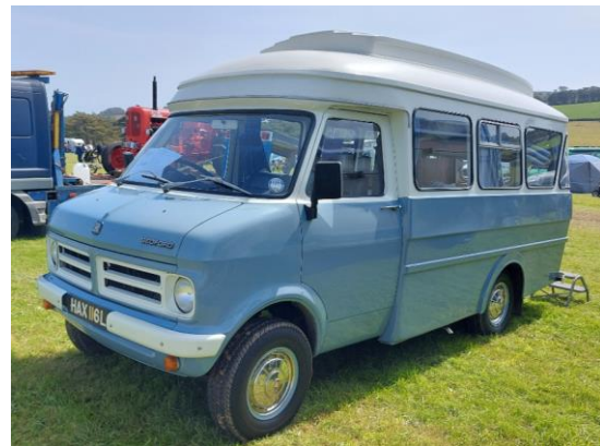
1973 Bedford Dormobile for sale at £12,000