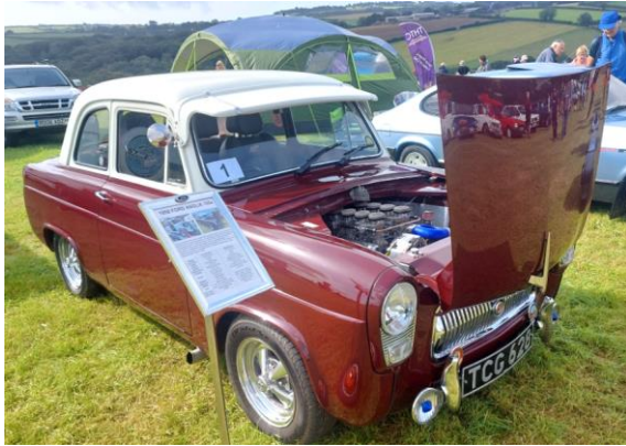
1958 Ford Anglia 100e powered by a 4.6 ltr TVR V8, just one of many mods. It sounded fantastic!

I'll keep this short as this has been a busy month for shows. In spite of happening just four days after Fowey, and it being Bank Holiday Monday, we had eight cars attending Great Trethew. There's not much to say, though it was a lovely day out. The weather was nice, there were lots of classic cars and lots more tractors which paraded and pulled great weights over a field. Most of the day was filled by club members having a good old natter and there's nowt wrong with that. Here are a few interesting items on show and you'll see there was something for everyone.