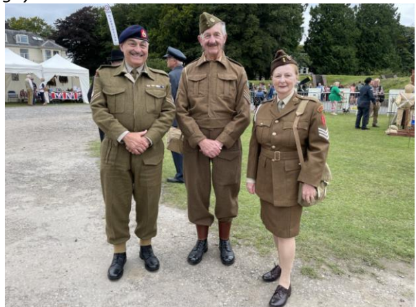
..and the baddies