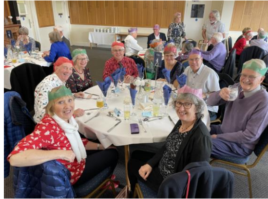
Bring on the food!