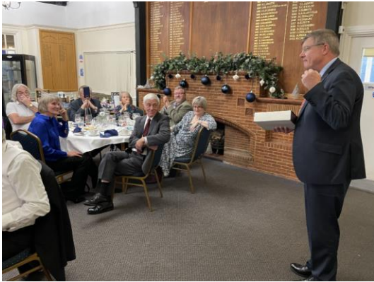
Announcing the winners