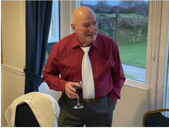
The birthday boy