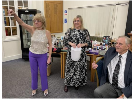
Calling out winning raffle tickets