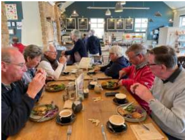
Lunch at Cafe on the Green, Widecombe