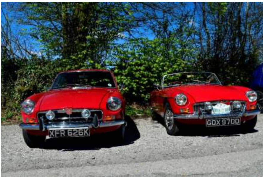
2 B's in a pod waiting to start the run.

20 Club MGs met on a beautiful sunny Sunday morning at the Dartmoor Diner in preparation for this year's Drive-it Day run. Teas and coffees were enjoyed before Simon ran through an overview of the run that we were about to undertake. This included a warning about potholes on the narrow road running to and alongside Drake's Leat (a good job he did warn us because some of these were horrendous).