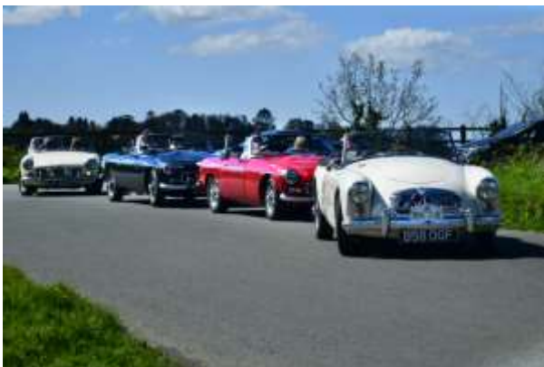
Round 'em up, head 'em out!