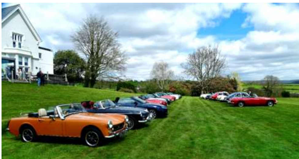
TVMGOC assembled at Welbeck Manor

It was nice to see other clubs out on Drive-It Day, I saw the Mazda MX5 club and a Ford club driving through Princetown, there was a classic Mini enjoying an ice-cream at Cadover Bridge.