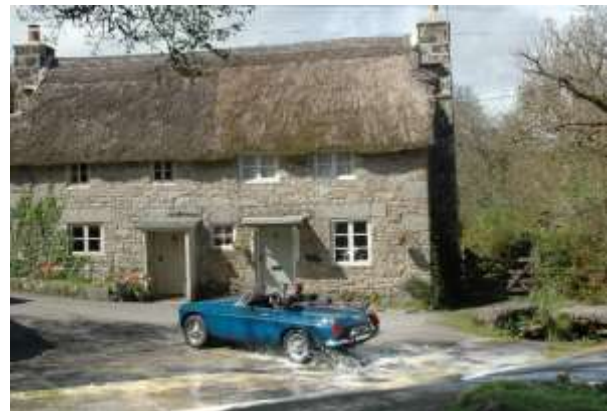
Fording the River Webburn at Ponsworthy