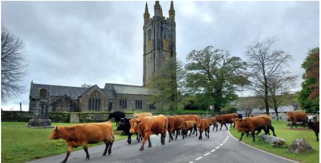
Drive with Moo Care