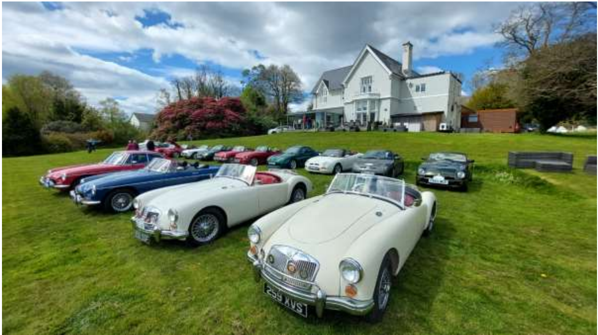
Welbeck Manor and the view from the terrace