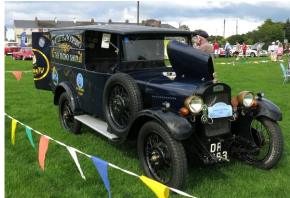
A Singer Junior delivery van