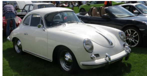
Cars I'd like to take home. Sadly, only the Porsche 360 would fit in my garage, if I could afford it!