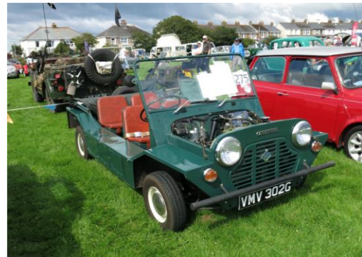
A VW beach buggy and an original Moke, but apparently someone has begun making new ones.