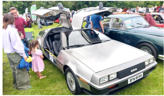
The DeLorean was in need of a new flux capacitor. Sadly, none of the traders had one.