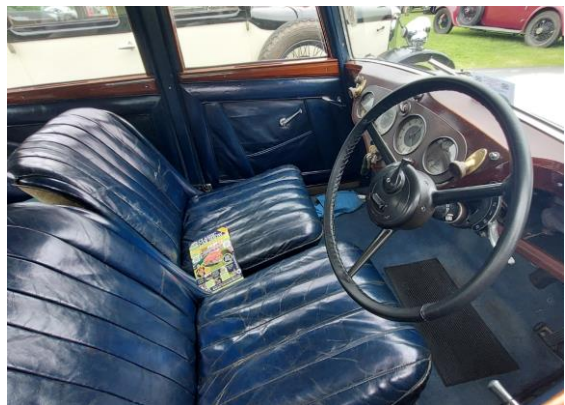
I was particularly impressed with this Daimler and its perfectly patinated interior.