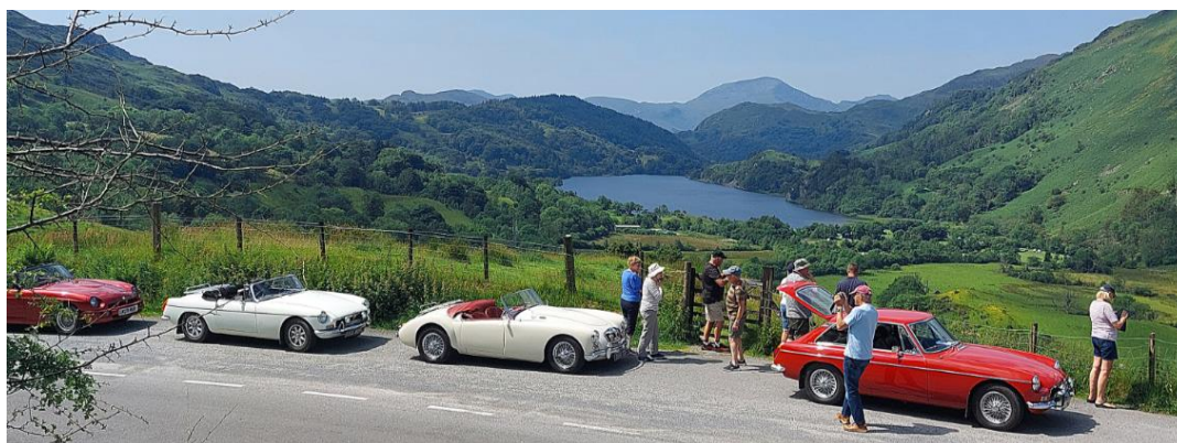
TVMGOC cars overlook the lake on which our hotel was situated in Snowdonia

Do not look for happiness in watches or bracelets, do not look for happiness in forks or sails. Happiness is laughter and friends, rain on your face, hugs and kisses. Don't look for happiness in shops, don't look for it in gifts, don't look for it at parties. Happiness is being loved by people, being respected, having parents alive, being able to play with your grandchildren. Happiness is what money can't buy... but you can buy an MG, and that will surely make you happy and do you no end of good!