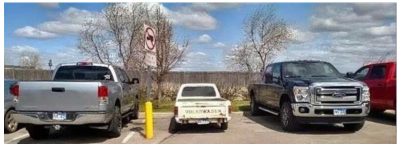
As you can see, the larger trucks form a protective barrier around the infants of the herd. Nature is beautiful.

One cylinder for the car the other for the trailer and let's go camping.