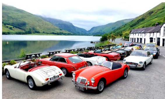
The hotel overlooks Llyn Mwyngil