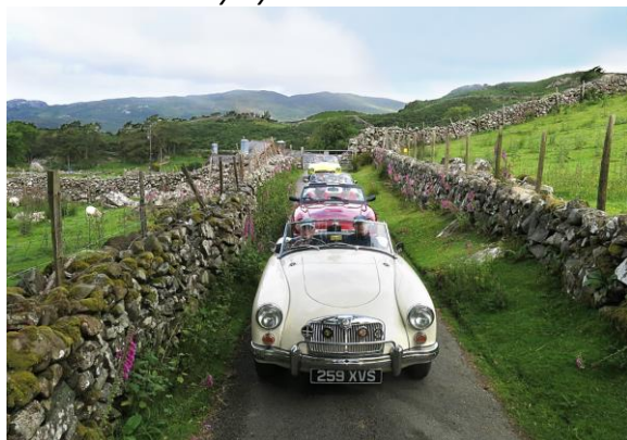
On the Cader Idris Route