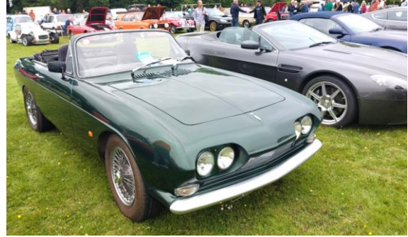
A rare Reliant Scimitar SC4 and an Aston. Choices, choices...