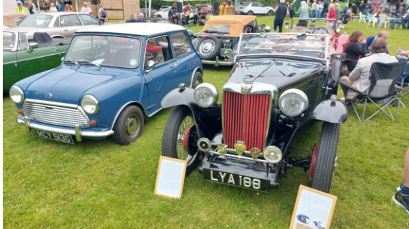
A Mini and a 1949 MGTC