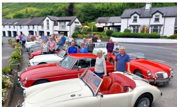
Tyn y Cornel Hotel