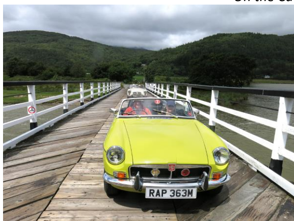
Paul & Sue cross Penmaenpool bridge