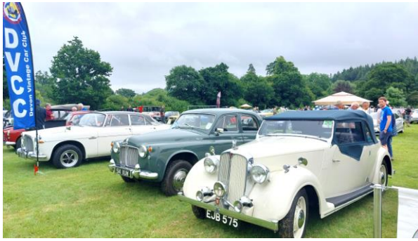
A trio of Rovers on the Devon Vintage Car Club stand.