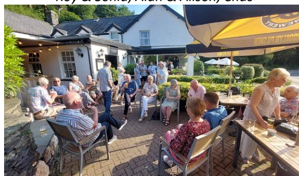
TVMGOC crews relax before dinner