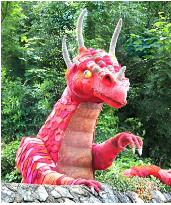
A huge and amazing knitted Welsh dragon

In 1807, the red dragon was adopted as the Royal Badge of Wales. In 1953, the motto Y Ddraig goch ddyry cychwyn ('The red dragon inspires action') was added, a line from the poem by Deio ab Ieuan Du.