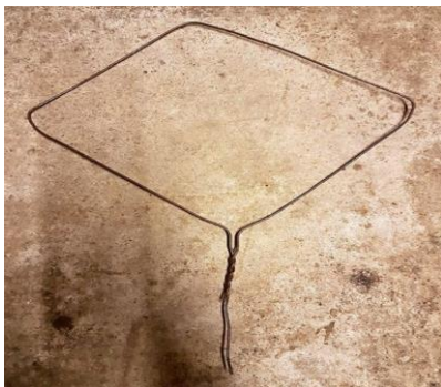
Just found. Vintage MGB car aerial. Offers?

One cylinder for the car the other for the trailer and let's go camping.