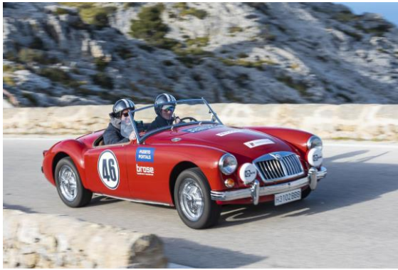
1957 MGA – a British entry