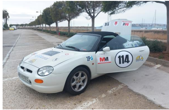
This Spanish MGF wasn't in the entry list