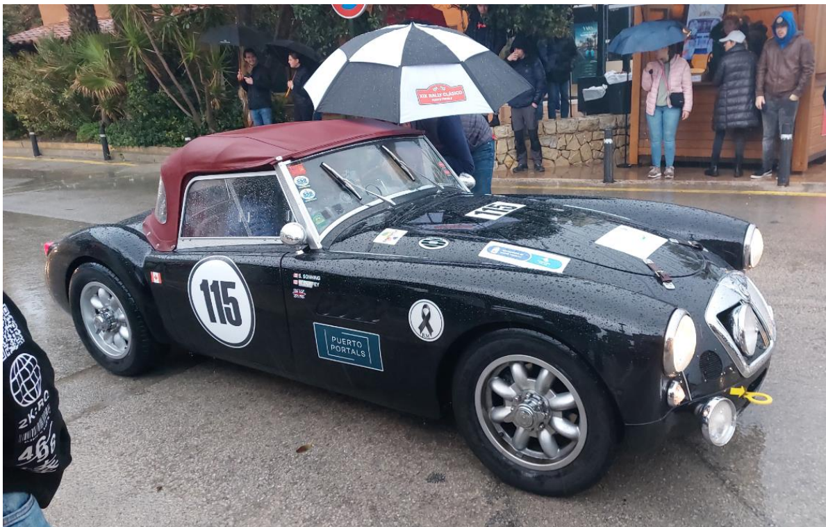
1958 MGA – a Canadian entry

The cars made one hell of a racket as they revved up for the crowd, though one or two sounded as though they had a bag of nails in the engine. They needed a bit of fettlin' after a hard drive I think.