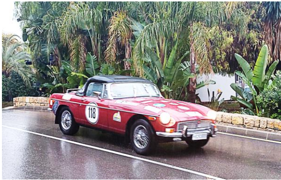
1973 MGB – a British entry

Over a hundred race-prepared cars were taking part and amongst them I spotted four MGs. Earlier in the day, this MGB had been suffering from an overheating alternator. While I was watching, a mechanic touched it whilst the engine was running and received a fierce electric shock. In the rain he must have earthed himself! It looked like the fan belt was a bit too tight, causing the alternator's bearings to overheat.