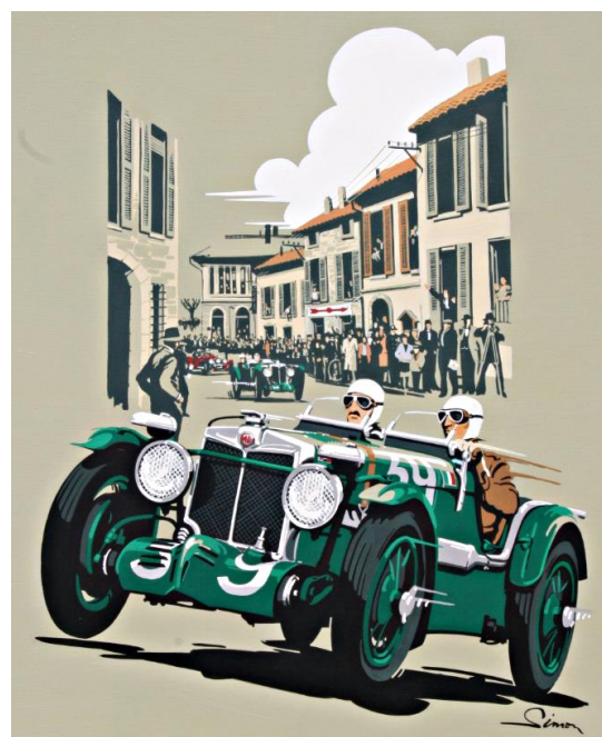
A 1934 racing Magnette special