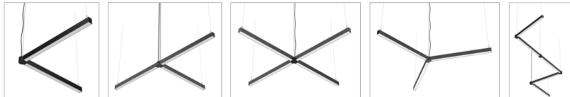
Diseño de iluminación flexible, diferentes formas de instalación